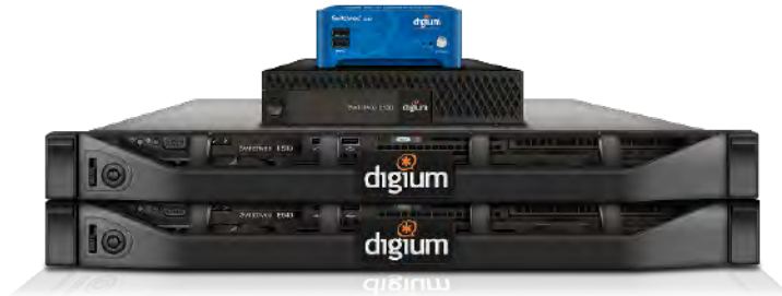
Four models to fit your needs. Starting from the top: Switchvox E510, Switchvox E520, Switchvox E530, Switchvox E540

Switchvox can also be deployed in a virtual environment using the power, scalability and disaster recovery tools available with VMware. Virtualization eliminates the need for a dedicated appliance and provides small and medium-sized businesses with a phone system that is able to meet the needs of an enterprise at a fraction of the cost.